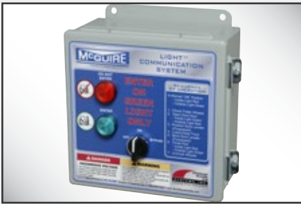
Light Communication System control panel for automatic lights - manual light control panel similar.