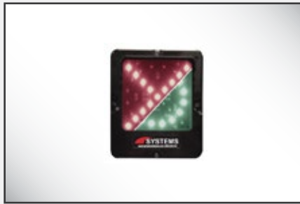
Exterior lights are standard with LED for extended life. One light shows a red X and a green circle for color-impaired individuals.