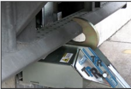
The TPR® hook rotates up to engage the RIG and secure the trailer to the loading dock.