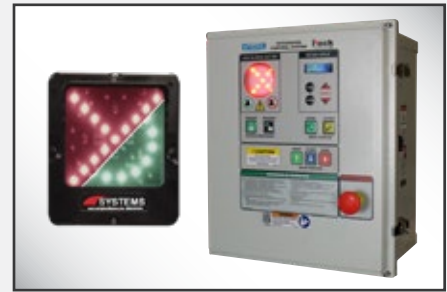
iDock® Controls includes light communication and can be integrated with other dock equipment.