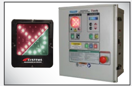
Includes light communication and can be integrated with other dock equipment in one controller.