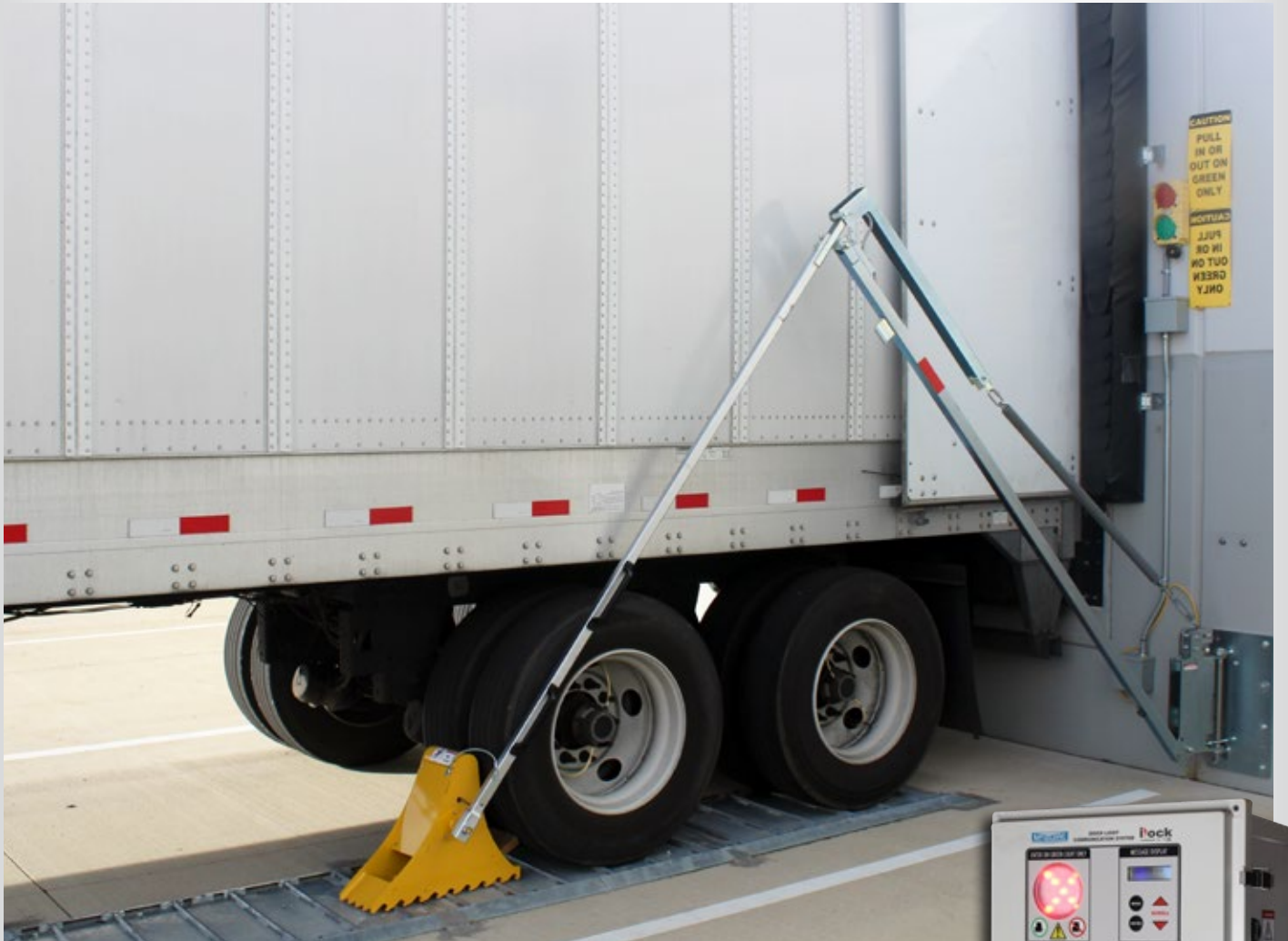
*UXL sample installation shown with optional snow removal ground plate. iDock Controls shown with optional dock light push button. Product subject to change.