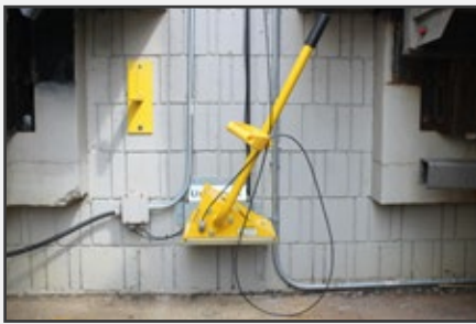
Easily stored and away from damage or debris.