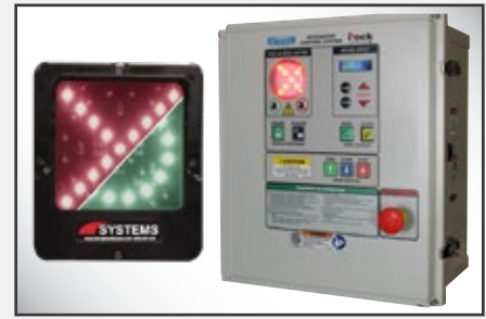
UniChock includes light communication and can be integrated with other dock equipment.