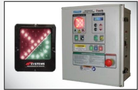
iDock® Controls includes light communication and can be integrated with other dock equipment.