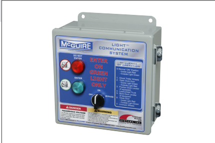
Dock Alert Communication System Control panel for automatic lights - manual light control panel similar.