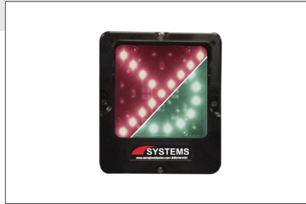
Exterior lights are standard with LED for extended life. One light shows a red X and a green circle for color-impaired individuals.